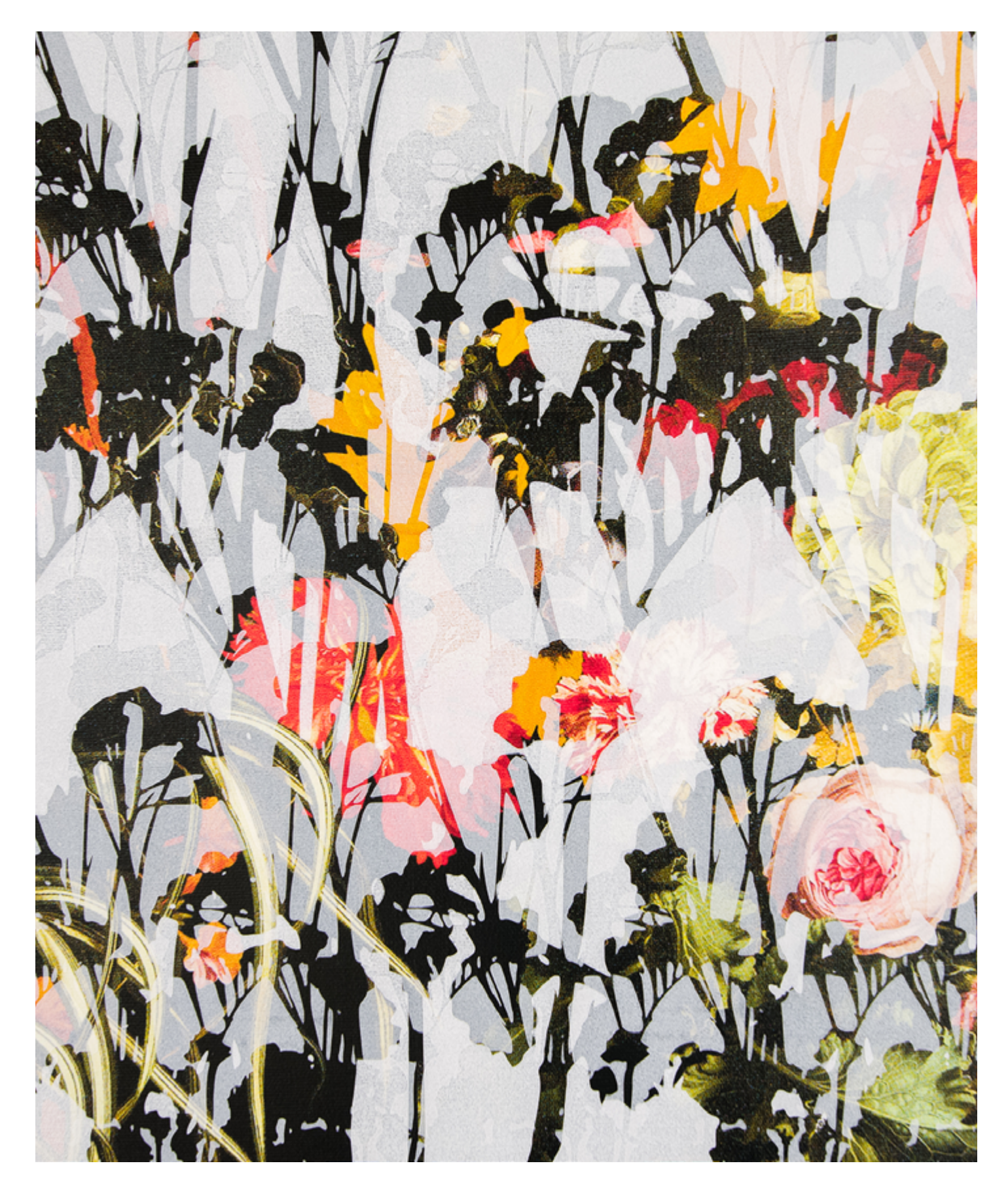
J Myszka Lewis, Flowers from Ghosts (sunflowers), 2024 detail image