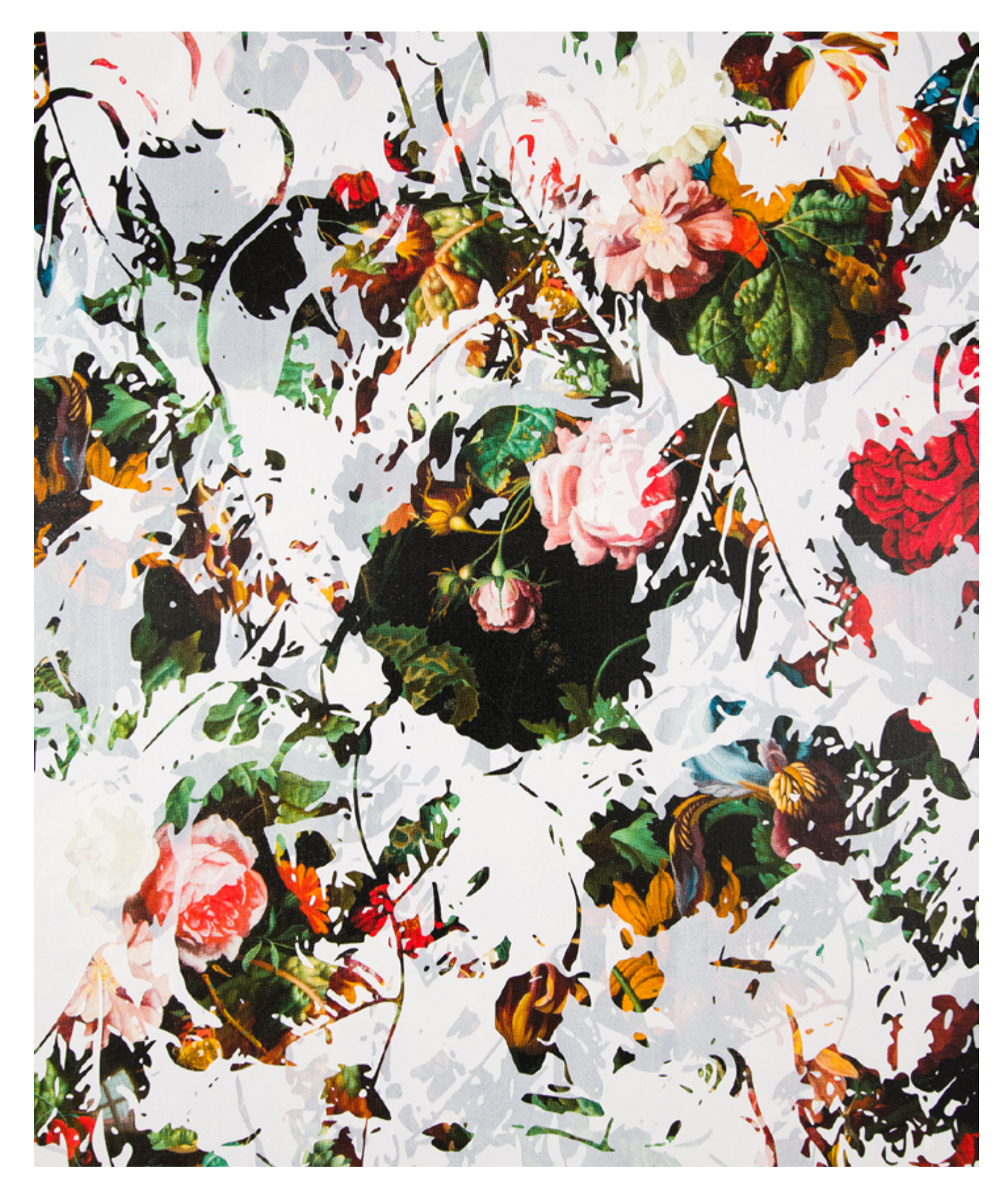
J Myszka Lewis, for we are only the rind and the leaf, 2024 detail image