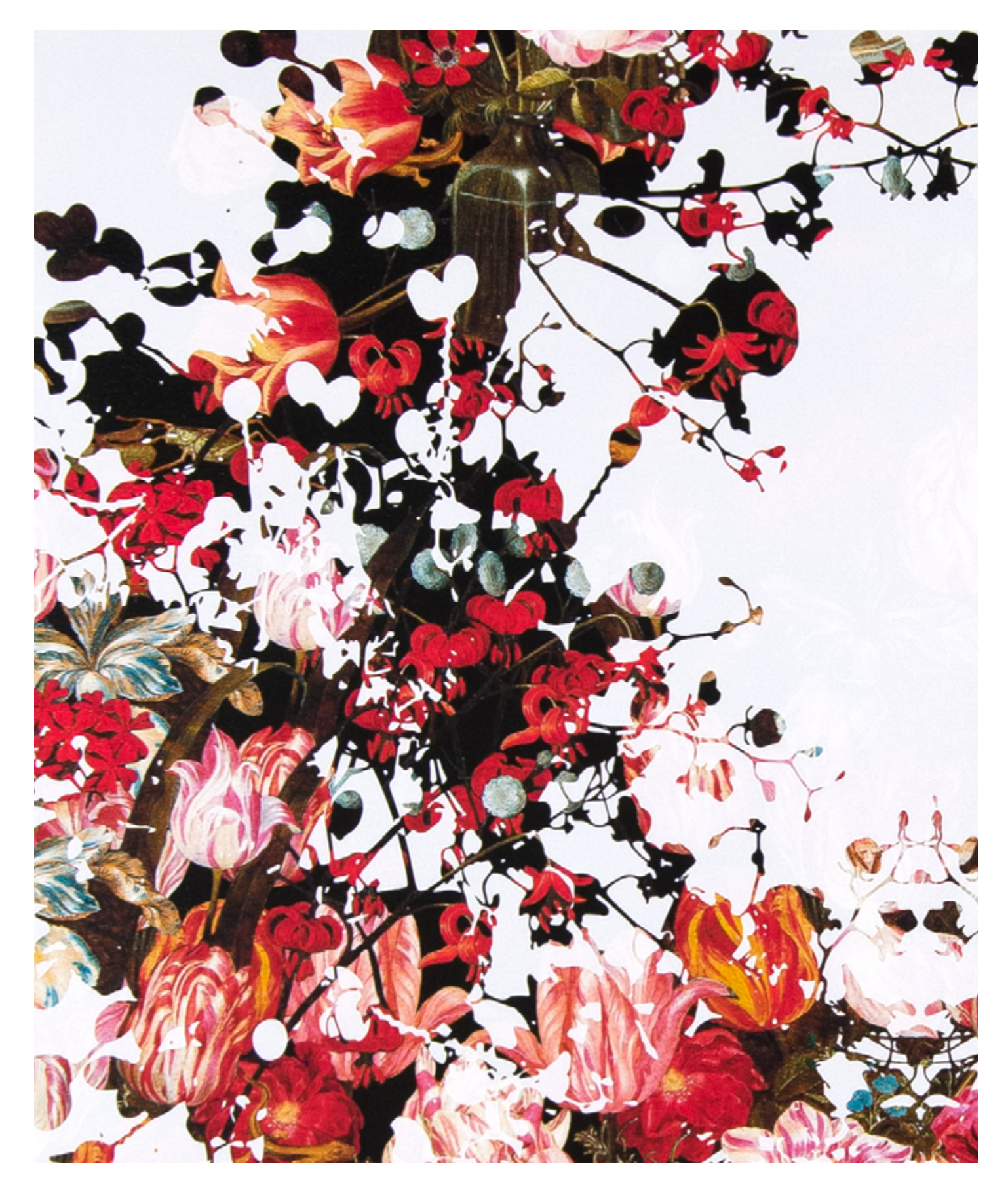
J Myszka Lewis, A Bouquet for Then and Now 5 (oncidium orchid, ranunculus, palm nut), 2023 detail image